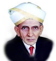
Sir M. Visvesvaraya

The Institution of Engineers (India), Jammu Local Centre congratulates all the engineers on the auspicious occasion of 162 nd birth anniversary of the greatest engineer of the soil Bharat Ratna Sir Mokshagundam Visvesvaraya . 15 th of September is celebrated as Engineers' Day all over the country as a mark of respect to Sir Mokshagundam Visvesvaraya who was born on this day in the year 1861.